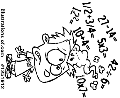
Illustrations of.com #1251912